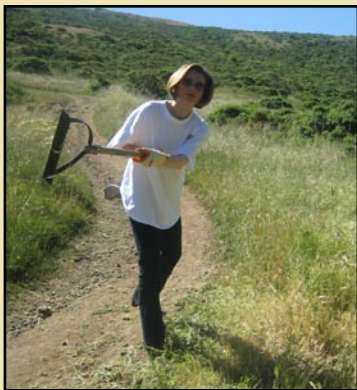
Trail volunteer at Tennessee Valley