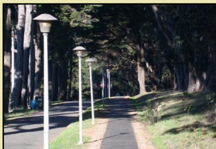
◀ Presidio Promenade

LOVERS’ LANE (Presidio): Asphalt repair on the trail crossings at Liggett and West Pacific will be completed in summer 2008. A design for the replacement of the aging light fixtures along this historic trail will be prepared in 2008 and installed in 2009. Project Manger: Rania Reyes