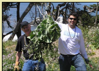
Volunteers weeding at Lands End

LANDS END: The new parking lot construction is complete and the western overlook and grand trailhead are under construction, with completion anticipated August 2008. Work completed to date includes: drilling and installing concrete and rebar piers for stability; grading the parking lot and installing a waste water recharger system; moving the parking lot entrance closer to the intersection to create safer and easier access to the area; creating planters between parking bays; and paving the majority of the parking area. This past winter and spring, project information coordinators engaged over 7,000