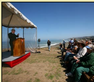
Mori Point community celebration

MORI POINT: Approximately 150 people participated in a community event on April 26th celebrating the completion of the first phase of site improvements and the ground breaking of the second stage of implementation this summer. Activities included guided site tours, a volunteer planting activity, meeting "Mori," the SF Zoo's San Francisco garter snake, and dedicating the newly installed entrance sign and interpretive kiosk.