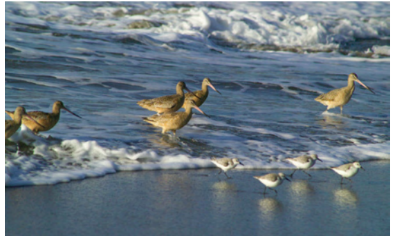
Top: Western Snowy Plover feeding at the high tide line. Bottom: Shorebirds feeding at the water's edge.