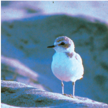
Western Snowy Plover resting on Ocean Beach.

In March 1993, the Western Snowy Plover ( Charadrius alexandrinus nivosus ) was listed as a threatened species, protected under the Endangered Species Act. Up to 100 of the estimated 2,300 birds remaining on the Pacific Coast can be found in Golden Gate National Recreation Area (GGNRA).