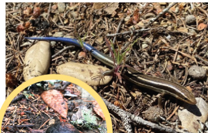
Western skink

You may find some creatures along the way: