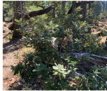
Foreground: tanoak resprout infected with SOD.

Turn around and return to the trailpost. Take Simmons Trail and continue your walk until the next trailpost. Turn right onto Benstein Trail .