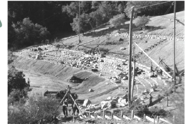
Mountain Theater at Mount Tamalpais in 1936.