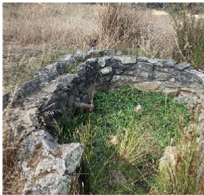
Left of trail: water tank. Right of trail: short rock wall.

From this trailpost, take a short detour down the Cataract Trail until you reach a short rock wall on the right. This is the natural spring that gives this trailhead its name, Rock Spring. Water from this spring feeds the water tank on the left side of this trail, which holds 20,000 gallons of untreated water for wildland fire response and prescribed fire.